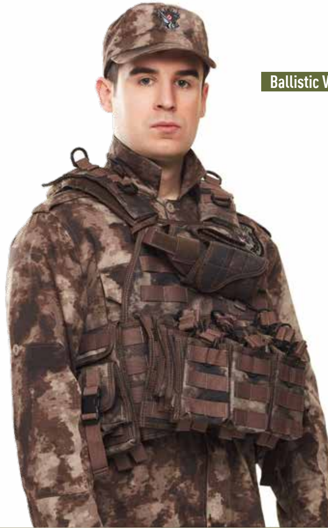
Ballistic Vest Models